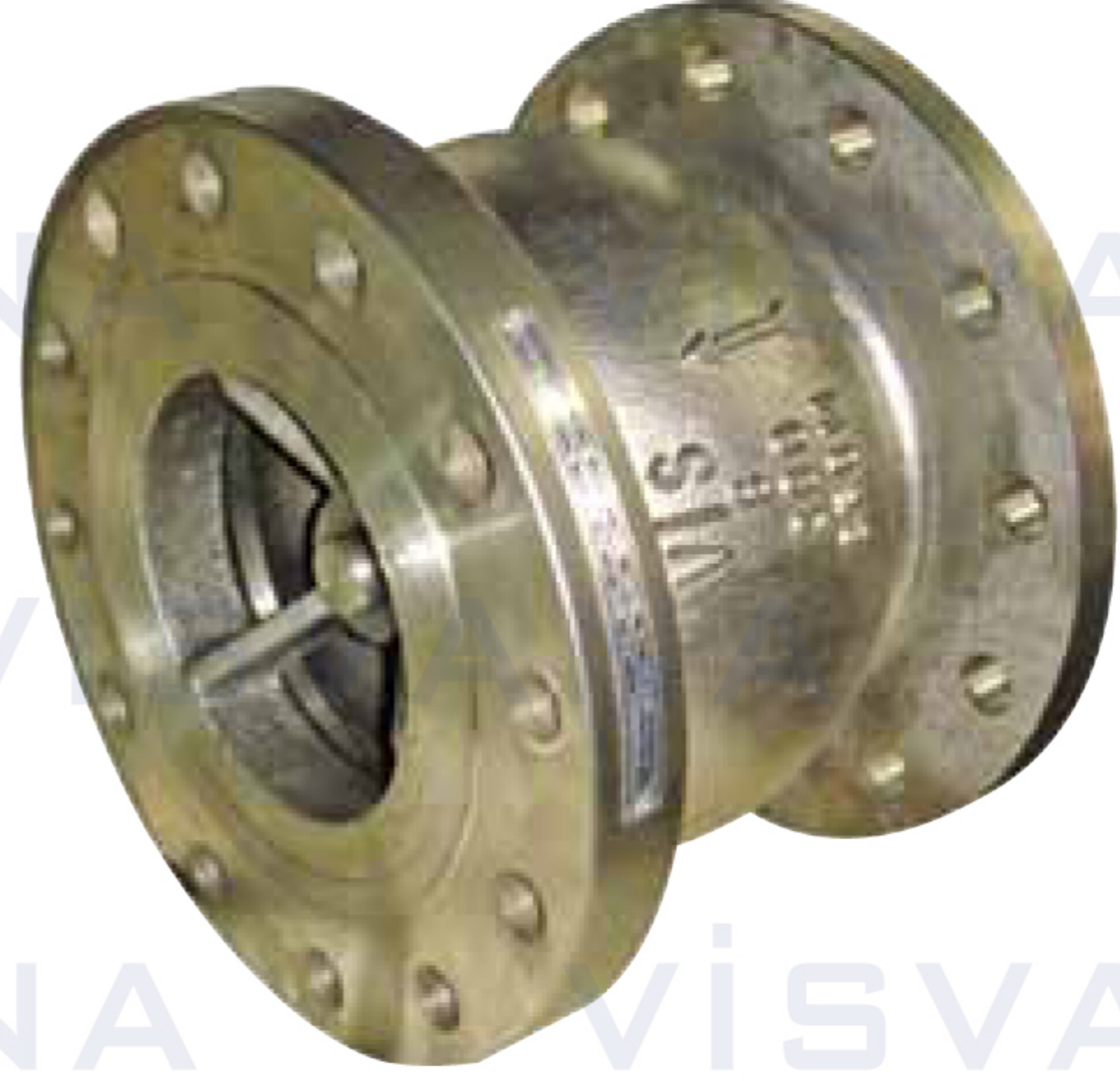
Note: 6" Class 300 A351 CF8M NOZZLE CHECK VALVE